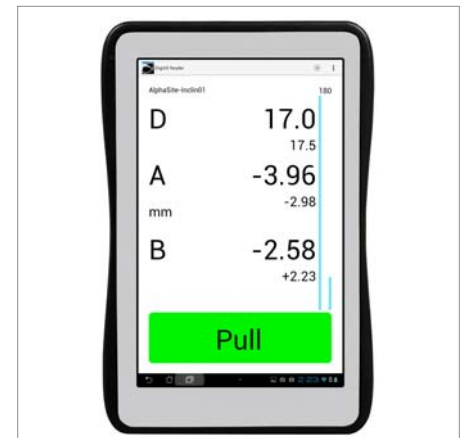
Hands-Free: Simply pull the cable to record a reading.

Afterwards, send surveys to the office via the internet, using email with automatic file attachments or Dropbox for full synchronization. If the internet is not available, use a USB cable for data transfers.