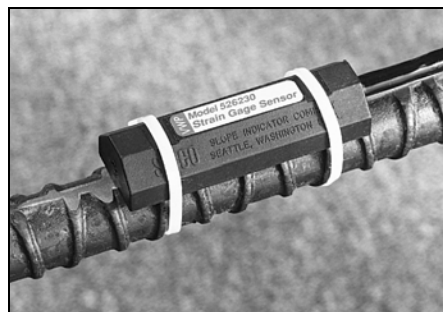
Spot-weldable strain gauge installed on reinforcing bar. The gauge is later waterproofed with mastic and tape.

Corrosion protection is applied to the gauge, and then the strain gauge sensor is placed on top of the sensor. After test readings, the sensor is fixed to the gauge either by weldable steel straps or by tie-wraps. The gauge and sensor are then wrapped with mastic and tape.